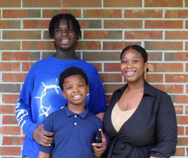
THE MIMS FAMILY